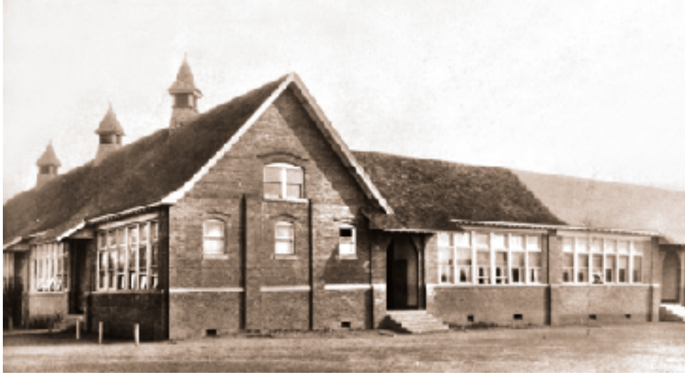
Early views of the school