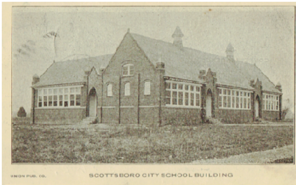
Postcard view of the new school labeled Scottsboro Elementary School