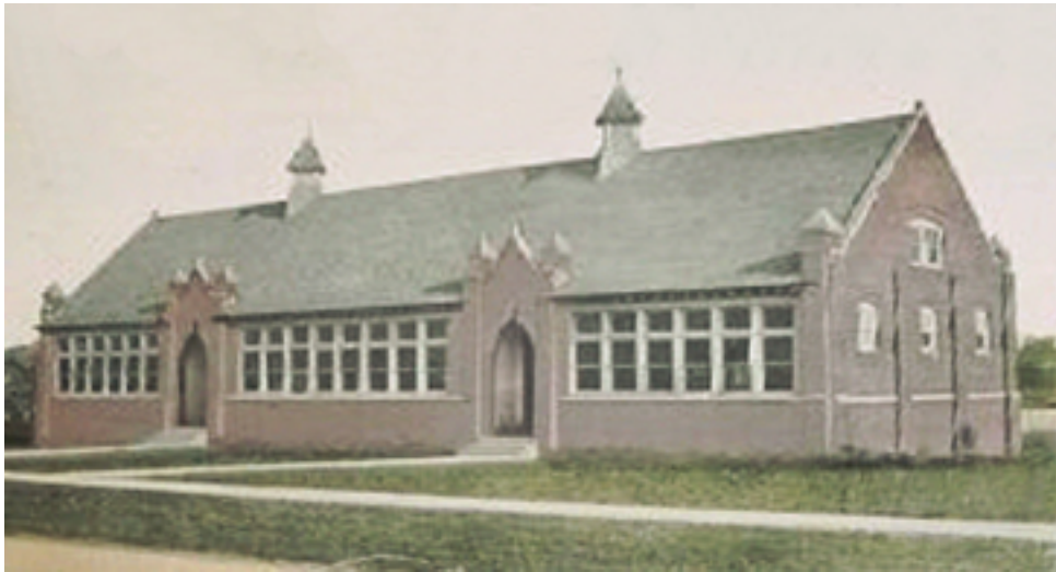
in the early 1940s