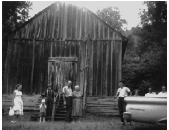
Cameronville and the older children to Stevenson. Cameronville consolidated with Stevenson in 1957.