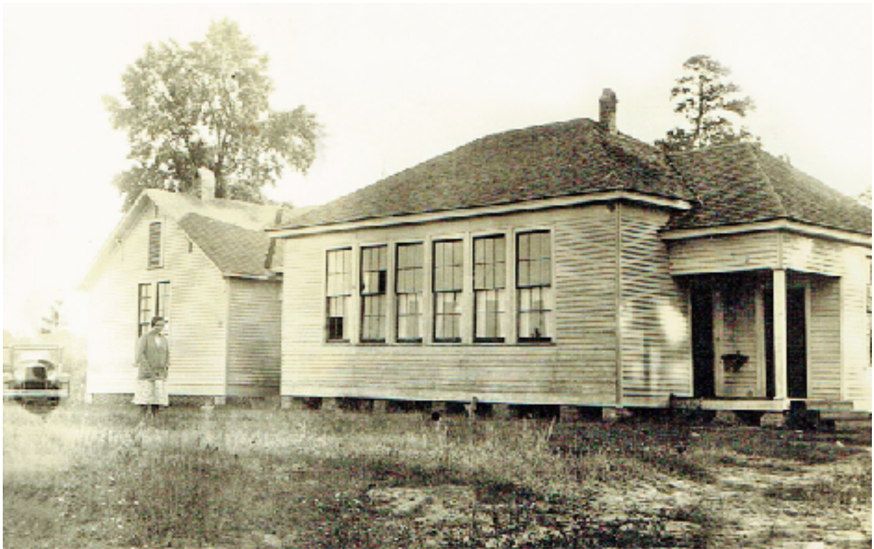
2003-2004 Fourteen elementary teachers, high school at North Jackson High School