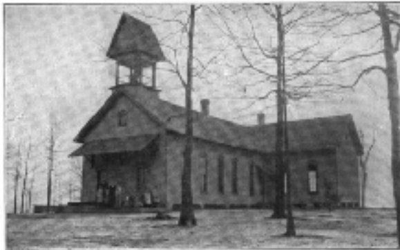
GREEN ACADEMY, NAT, ALABAMA.

One cannot help being impressed by the beautiful scenery, while watching the train more than one thousand feet below, wending its way along the green valley and shut in on either side by rugged mountains, as if rejoicing in their own height.