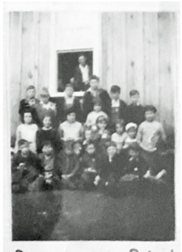
Cave Springs School