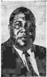
from Alabama State College, a master of arts degree from the University of Michigan, and further study at the University of Michigan, Ohio State University, Fisk University, and Western Reserve University. He has been appointed for the third consecutive summer as a participant in mathematics to the National Science Foundation Summer Institute at Western Reserve University. He is a member of St. Paul A. M. E. Church and is active in all phases of church work. He is board, church treasurer, Men's Bible Class teacher and adult teacher in the A. C. E. League.