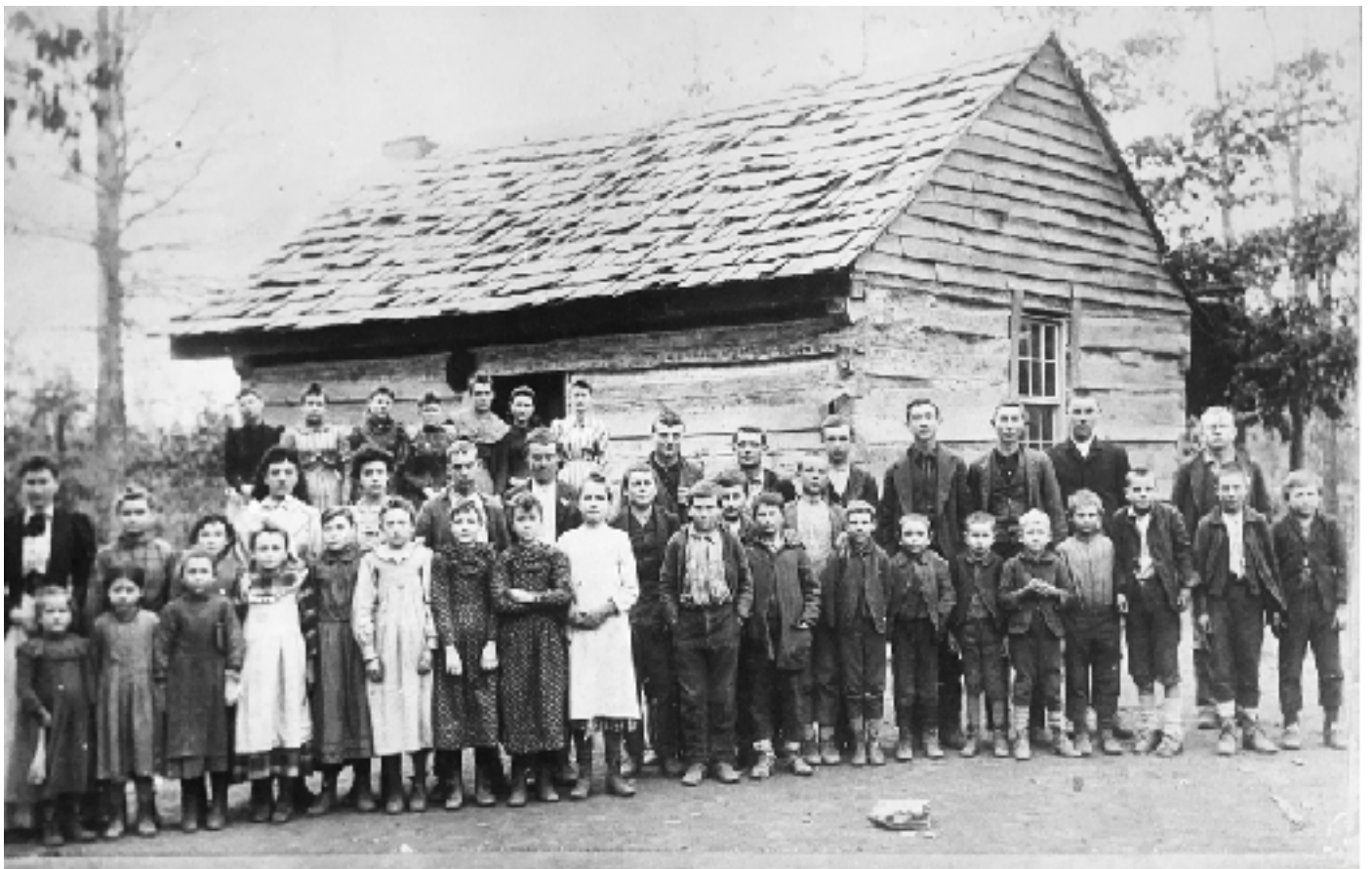
Campground school using these two 1936 USGS maps, locate Burgess Cemetery and across the original Dry Creek.