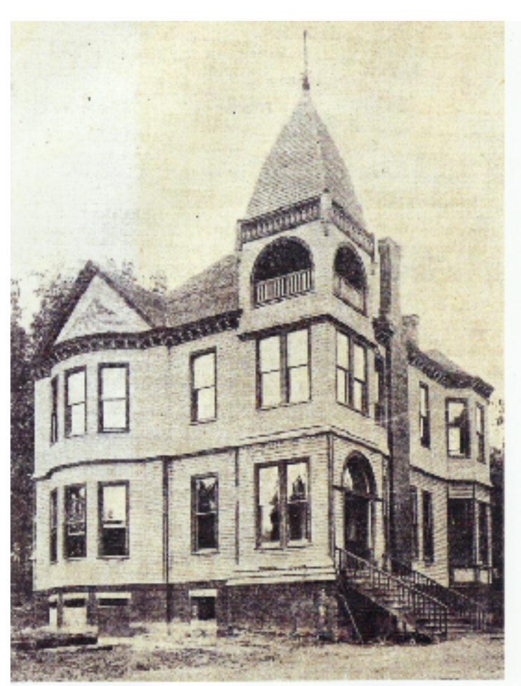
Bridgeport, Alabama Public School 1908

fing originally built in 1852 on North Hudson Assuur for the Alahama College of Dental Surgery.