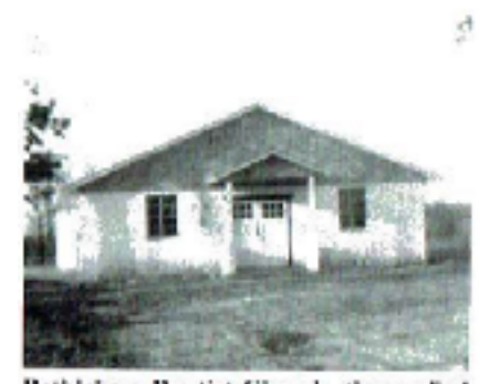
Bethlehem Baptist Church, then called Overlook Church

Jul 20, 1939 PA: Bids let for school bus route, one of which covers Overlook School.