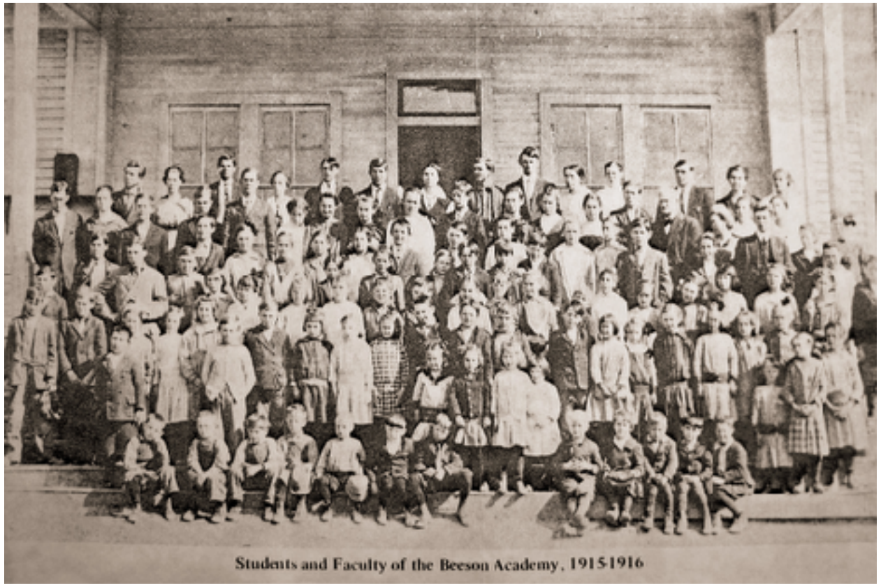
Students and Faculty of the Beeson Academy, 1915-1916