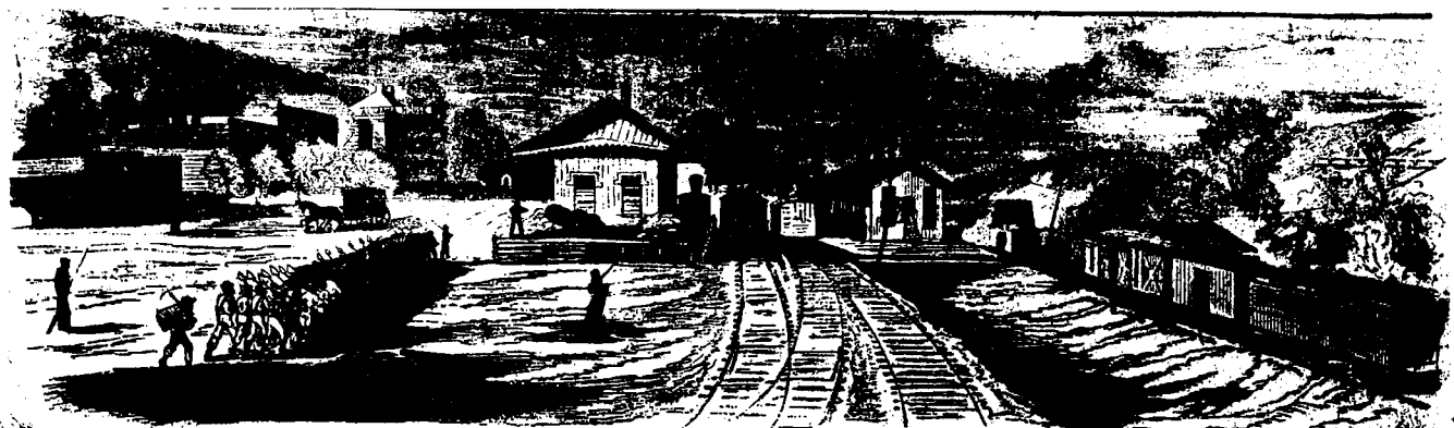
THE TOWN OF STEVENSON, ALABAMA, HELD BY THE UNION FORCES. —(See Page 44.)